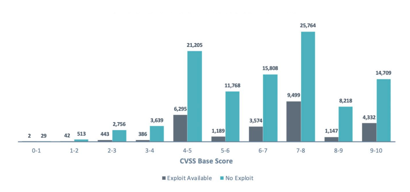
Figure 2. Exploit availability for CVSS base scores

Even if your team could tackle all the vulnerabilities that score 7 or higher, it turns out less than one-quarter (24 percent) of them currently have exploits available (see Figure 2). In other words, if you're using a CVSS 7+ strategy to prioritize remediation efforts, you're wasting 76 percent of your team's time fixing vulnerabilities that pose little to no near-term risk.